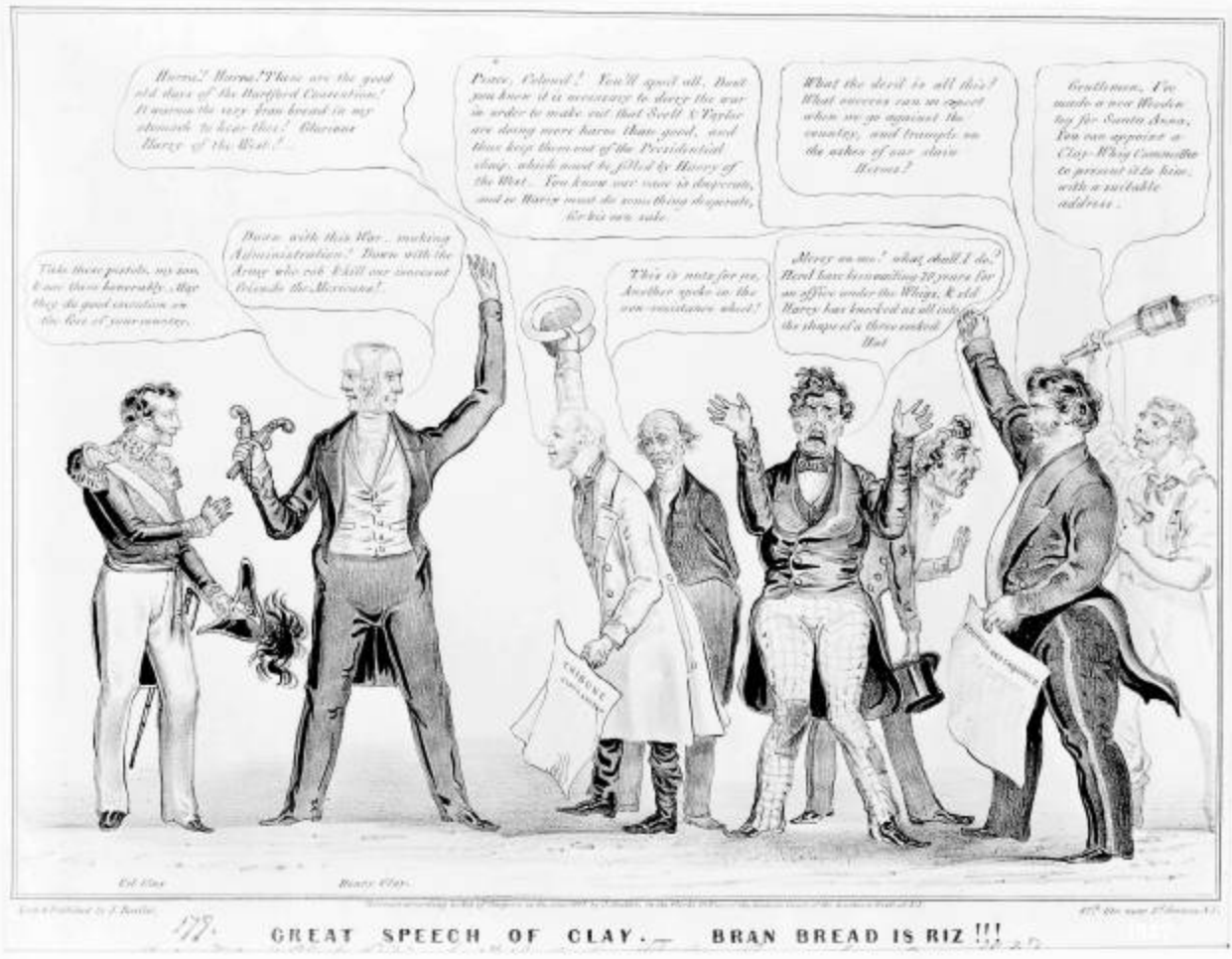
CARTOON #7 (Zachary Taylor for President, 1848)