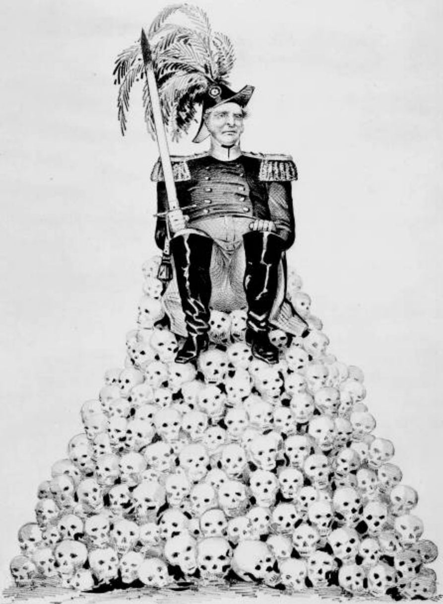
AN AVAILABLE CANDIDATE. THE ONE QUALIFICATION FOR A WHIG PRESIDENT.