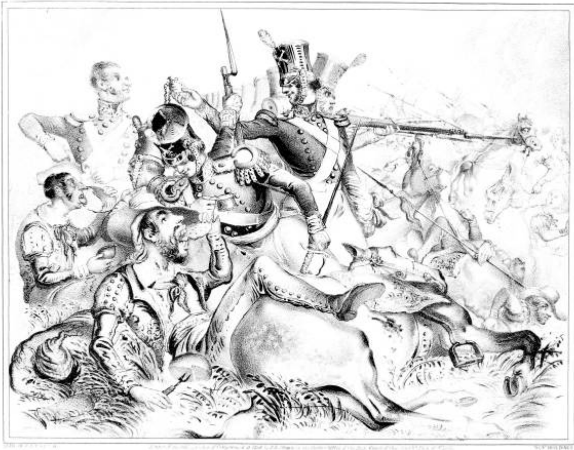
At THE BATTLE OF PALO ALTO, the Americans greatly distinguished themselves, as well for their bravery, as their humanity toward their unfortunate adversaries. In the heat of the battle they were frequently seen handing their cartridges and rations to the wounded - Mexicans.