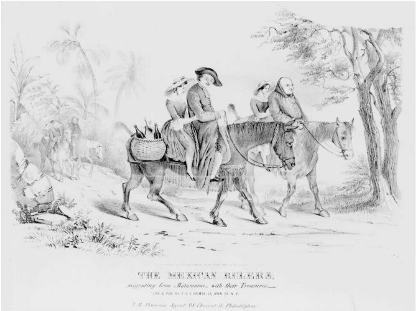
CARTOON #5 (Daniel Webster & President Polk, May, 1846)