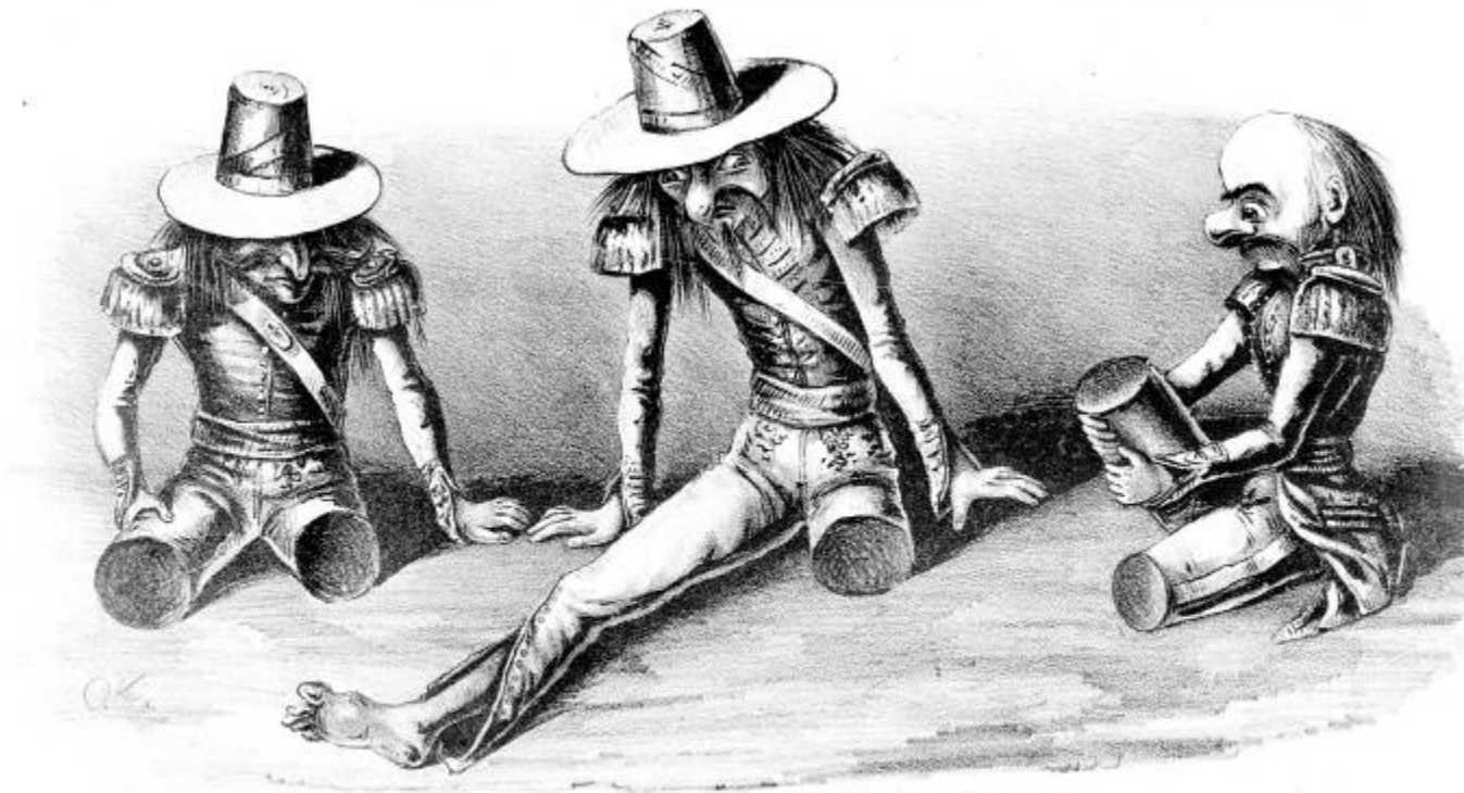
CARTOON #2 (Battle of Palto Alto, May 13, 1846)

Reproduced by permission of the War Office from the original copy of the Political Sketches of the American Journal of the British.